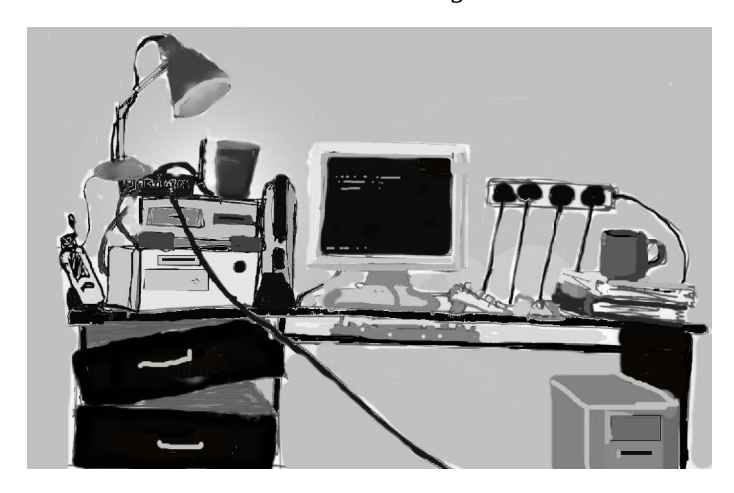
Chapter 3 The Operation

"So it is then. We will initiate operation Z. The offer has been declined." The man behind the large Oak desk put the phone back on the hook, and sat relaxed, leaning back, smiling, confident in his position.